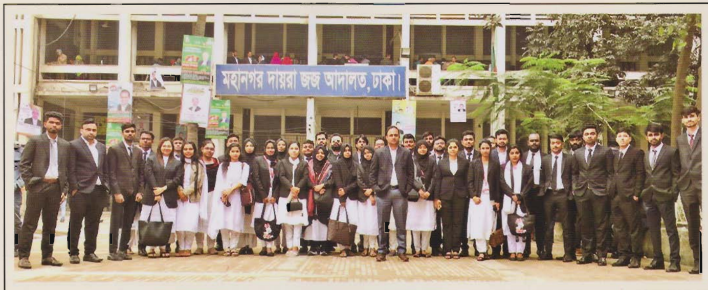
Students in court visit program at Court of District and Sessions Judge, Dhaka with their course teacher