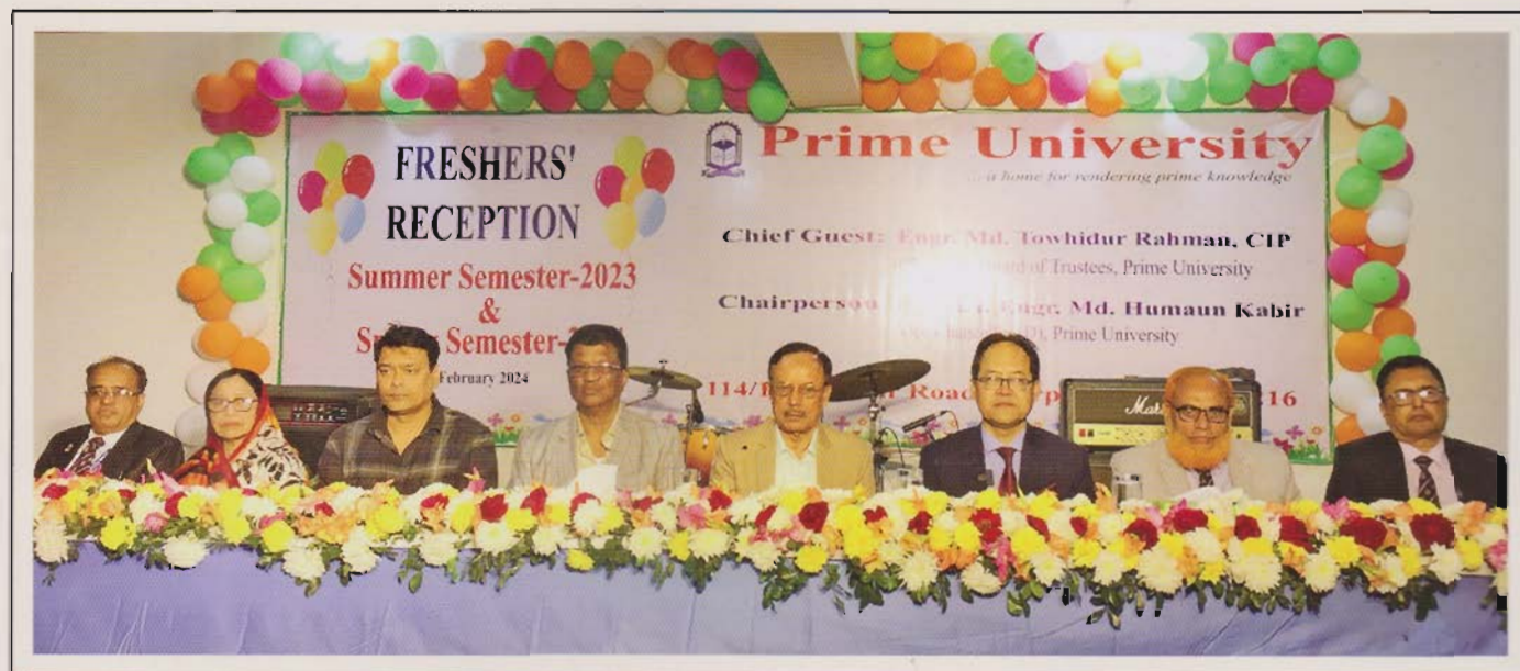
A view of the Freshers' Reception program

The Fresher's Reception Ceremony for the newly enrolled students of different undergraduate and graduate programs in the Summer Semester 2023 and Spring Semester 2024 was held at Prime University on February 18, 2024.