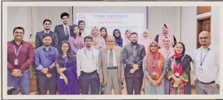
Participants with faculty members of English and Dean of Arts and Social Sciences