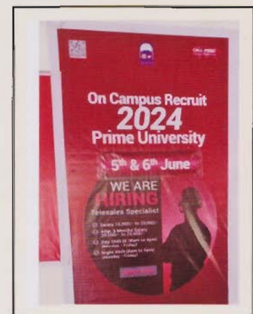
Career Expo Fair

20 students availed of the opportunity and 10 were selected for initial training by Call Point Business Solutions Ltd.