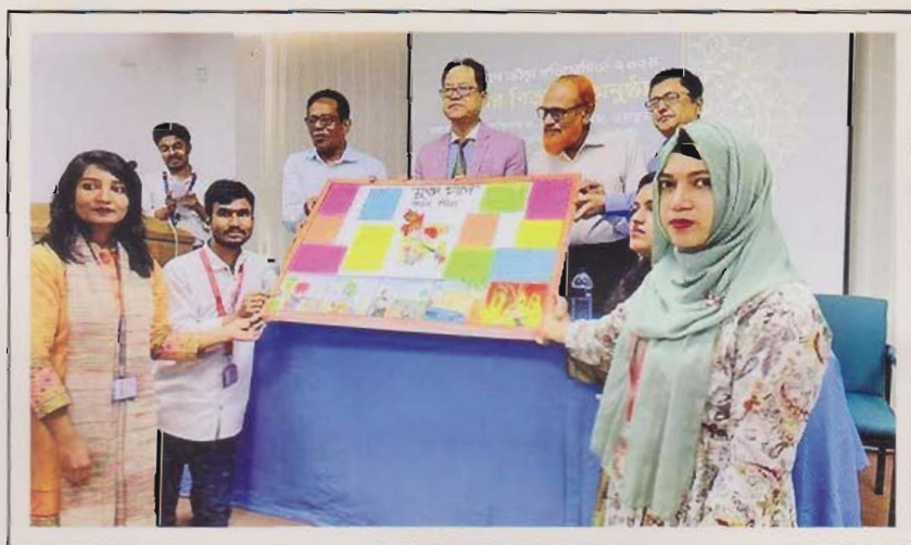
Unveiling the Wall-magazine 'Muktolipi'

A Prize giving ceremony of Intra-Department Indoor Games of the Department of Bangla was held on May 16, 2024. The Vice Chancellor (acting) of the University was the Chief Guest of the ceremony while Dean of the Faculty of Arts and Social Sciences and Registrar were the Special Guests. The participants of the intra-department indoor games were congratulated in the program. Crests were handed over to the winners. In the later part of the program, 'Muktolipi', a wall-magazine was unveiled. The magazine is going to be a regular publication of the Department of Bangla.