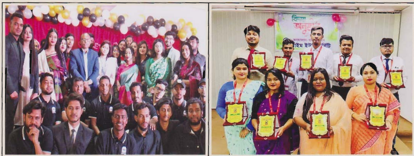
Photo sessions of the outgoing students: Department of CSE (left), Department of Bangla (right)

graced by the Vice Chancellor (acting) of the University. Heads and faculty members of respective departments were present in the programs. Everybody wished the students very bright future and hoped that they will bring pride and glory to themselves and to this country as well. The ceremonies ended with colorful cultural programs participated by students and faculty members of respective departments.