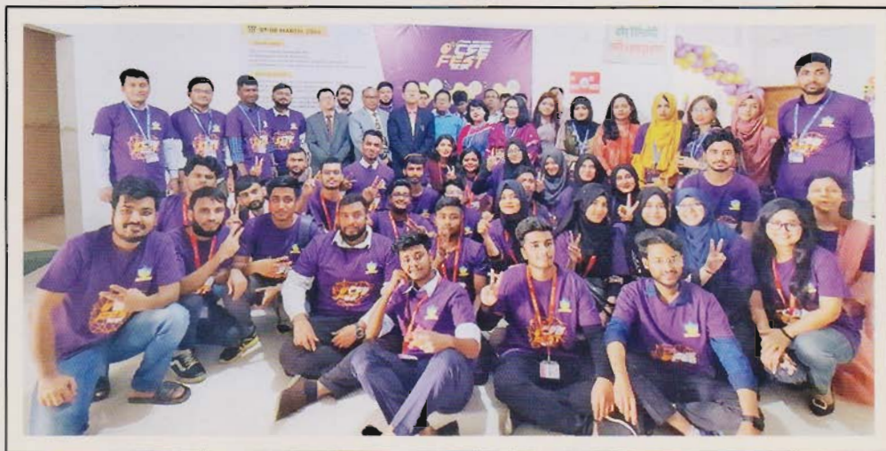
A view of the CSE Fest