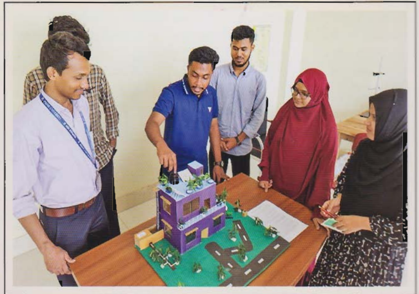
One of the Presentations on 'Green Architecture'

On June 23, 2024, the 8 th batch students of the Department of Civil Engineering took center stage as they showcased their innovative projects on "Green Architecture." This event was a testament to their creativity, technical expertise, and deep commitment to sustainable design. Each project reflected a thoughtful approach to integrating eco-friendly practices into architectural design, highlighting the students' ability to balance aesthetics, functionality, and environmental responsibility. From energy-efficient building concepts to the use of renewable materials, the projects demonstrated a forward-thinking vision for the future of architecture. The dedication and hard work that went into these projects were evident, making it a proud moment for our institution. Their work not only inspires but also sets a high standard for future batches to follow.