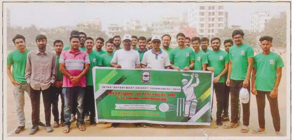
Participants and Organizers of Intra-Department Cricket Tournament 2024