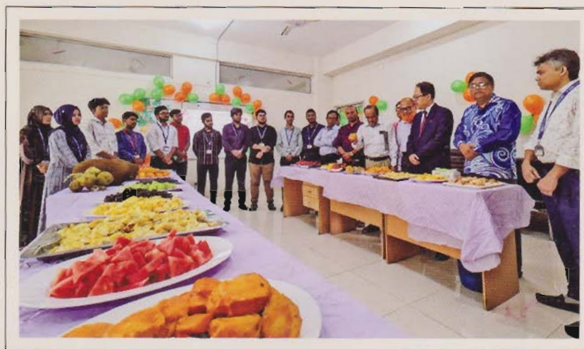
Inauguration of fruit festival by VC, Treasurer, Registrar and other esteemed faculties

On June 7, 2024, the Department of Civil Engineering brought a burst of color and freshness to the campus with a vibrant Fruits Festival. The event was inaugurated by the Vice Chancellor (acting) and was further enriched by the presence of the esteemed Treasurer, Dean of the Faculty of Arts and Social Sciences, Registrar, Controller of Examinations, Director of IQAC, Heads from different departments, faculty members and students of the Department of Civil Engineering. This lively festival was the brainchild of the dedicated Civil Engineering students, who poured their creativity and effort into making the event visually stunning and enjoyable.