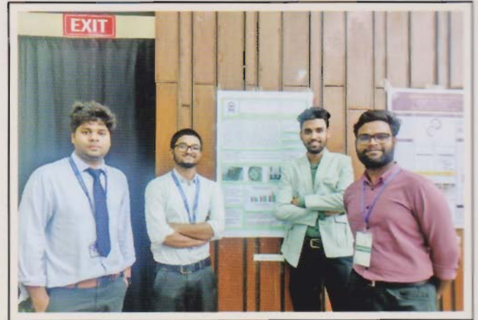
Participants with faculty members of CE