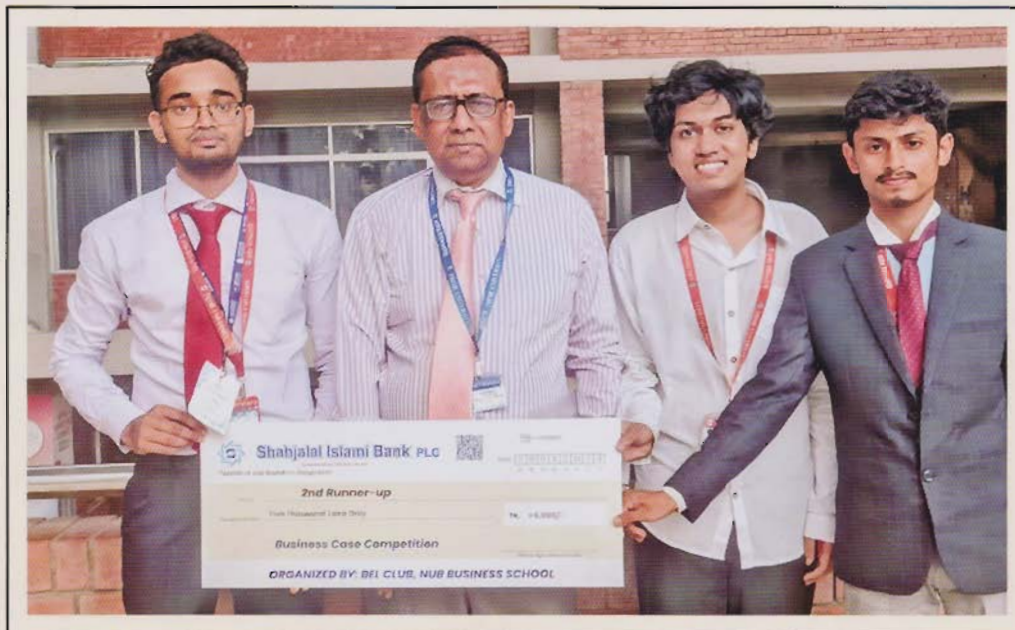
Prime University achieved the second runners-up position