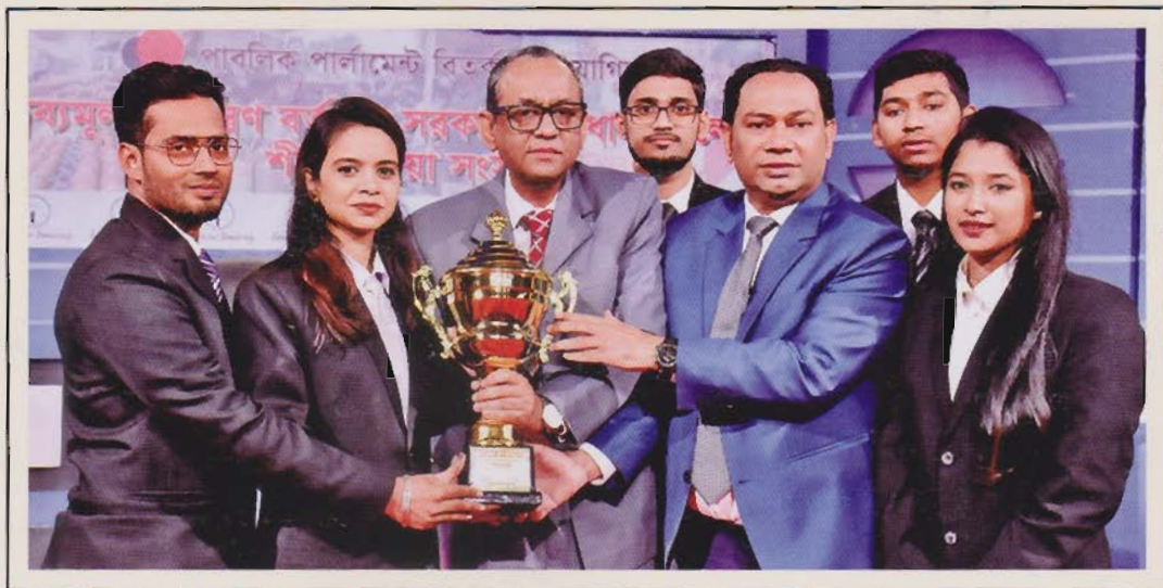
Prime University team became Champion