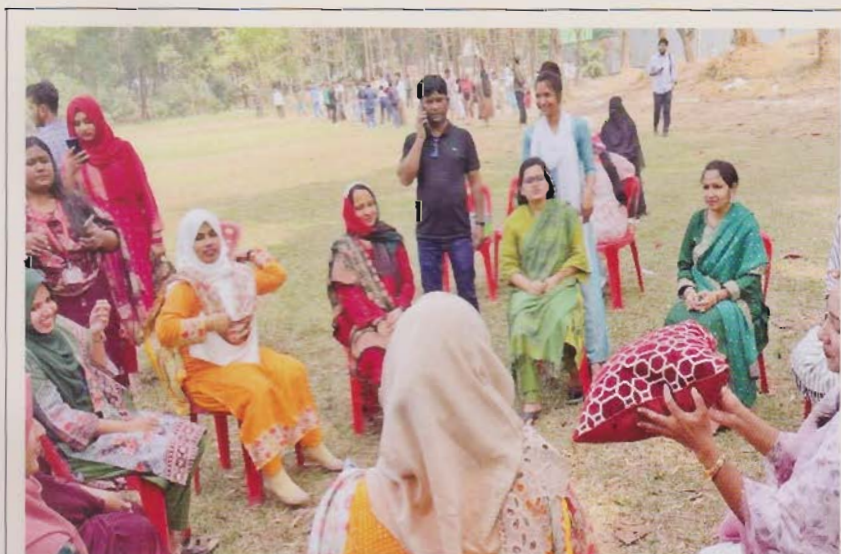
A pleasurable moment during picnic 2024