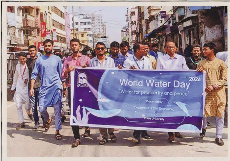
Rally with the faculties and students of CE

The Department of Civil Engineering celebrated World Water Day 2024 on March 22, 2024, with a splash! The department organized a rally dedicated to raising awareness about the critical importance of water conservation and sustainability. Students, faculty, and staff joined forces to highlight the pressing need for responsible water usage and the protection of our precious water resources. The event was not just a rally but a movement, inspiring everyone to take action for a brighter, water-secure future. Together, we're making waves in the fight for sustainable water management and environmental stewardship.