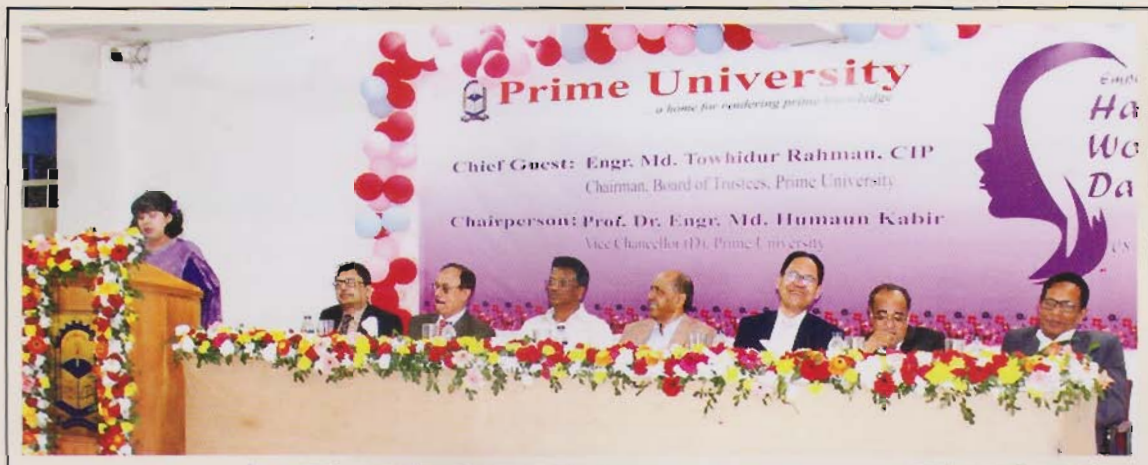
Celebrating International Women's Day-2024