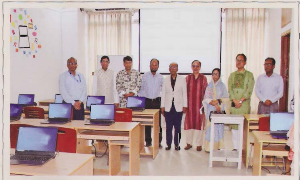
Honorable Members of BOT with others during the program