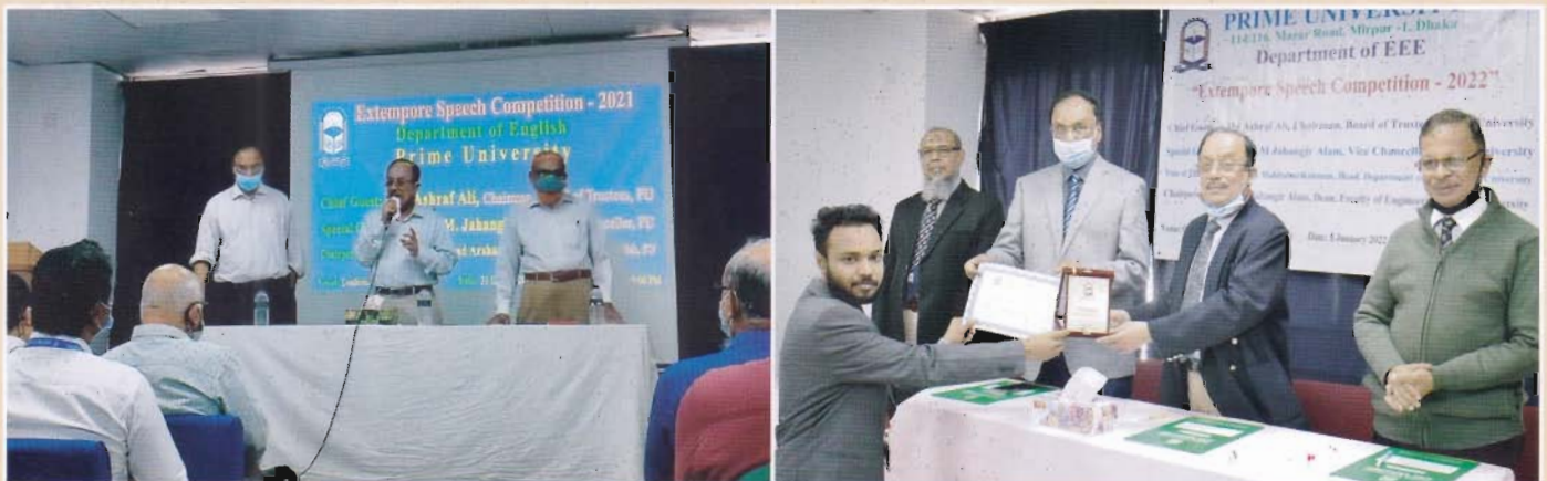
Views of the extempore speech competitions in the Department of English (left) and in the Department of EEE (right)