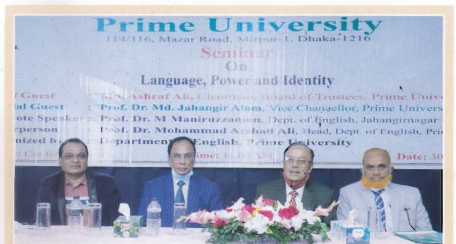
From left: the Keynote Speaker, Special Guest, Chief Guest and Chairperson of the seminar