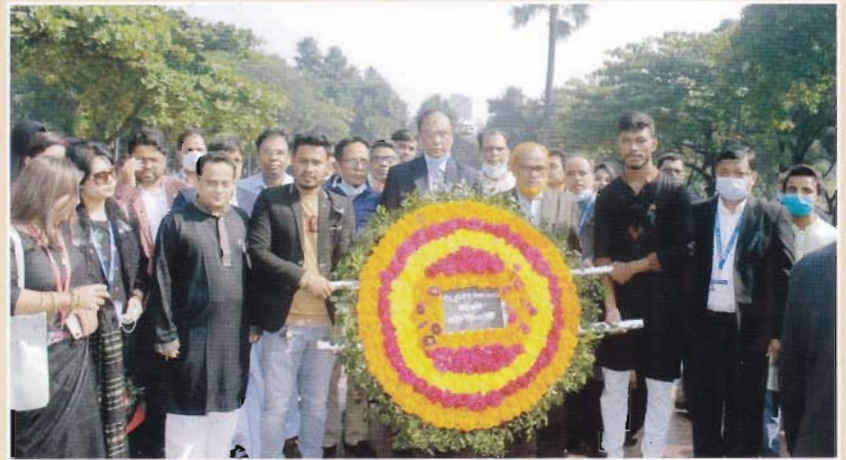
The Vice Chancellor along with the Dean of different faculties, Registrar, Heads and faculty members of different departments, executives and students on way to pay tribute to the Martyred Intellectuals