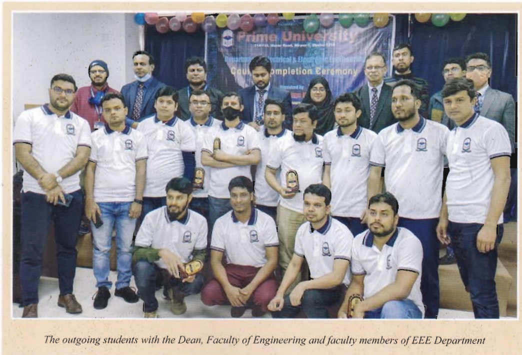
The outgoing students with the Dean, Faculty of Engineering and faculty members of EEE Department