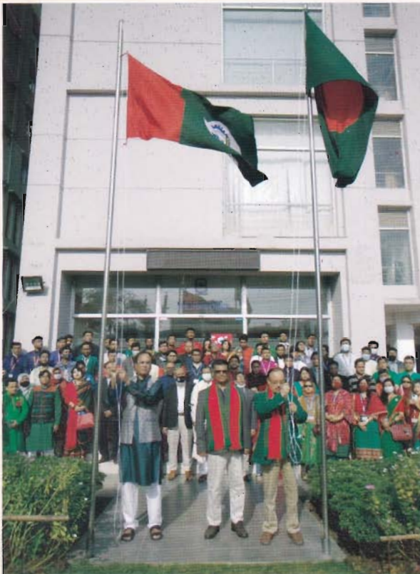
The National and the University flags are being hosted by the Chairman, BoT and the Vice Chancellor respectively on the Victory Day, 2021