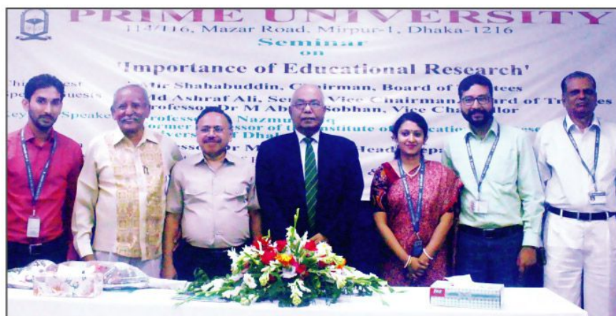
Faculty members of the Department of Education with Vice Chancellor and the keynote speaker