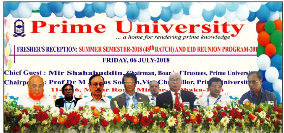
A view of the Freshers' Reception and Eid Reunion Program