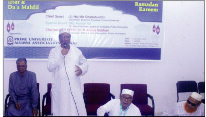
Views of the iftar and doa mahfils