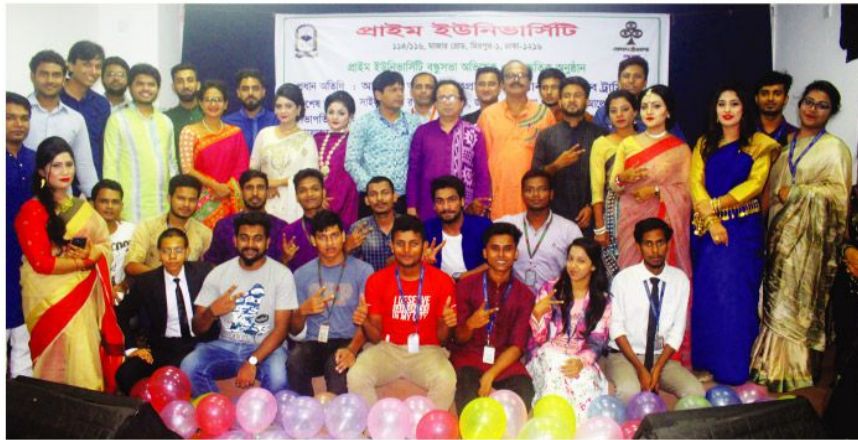
A group image of the inauguration Program