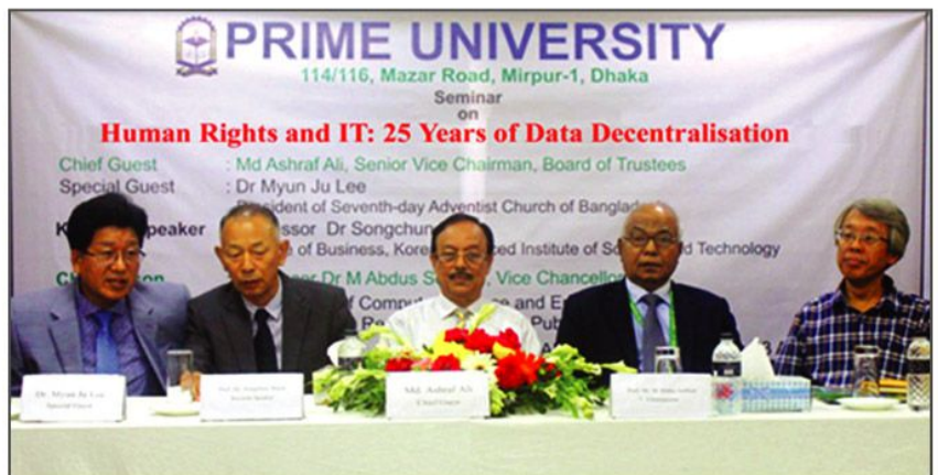
A view of the dais during the seminar