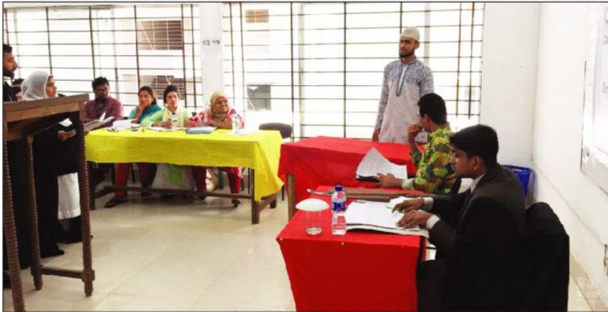
A view of the mock trial