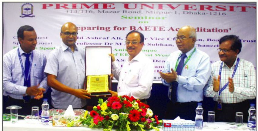
A crest is being handed over to the keynote speaker by the Senior Vice Chairman, BOT