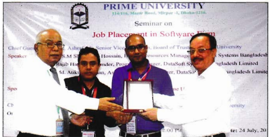
A glimpse of handing over of memento to the speakers