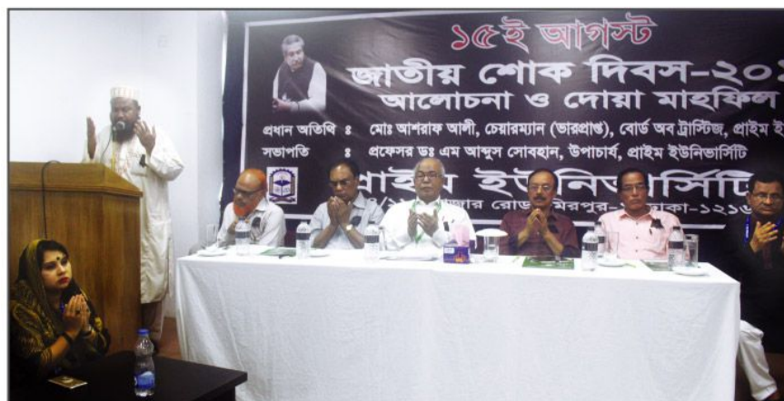
Special munajat is being offered on the National Mourning Day