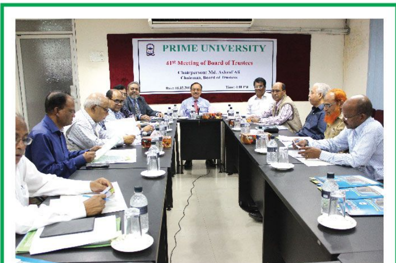
A meeting of the Board of Trustees of Prime University was held on 16.03.2015 in the conference room. The meeting took many important decisions on the academic, administrative and infrastructural development of the university through lively discussion participated by the honorable Chairman and Members of the Board.