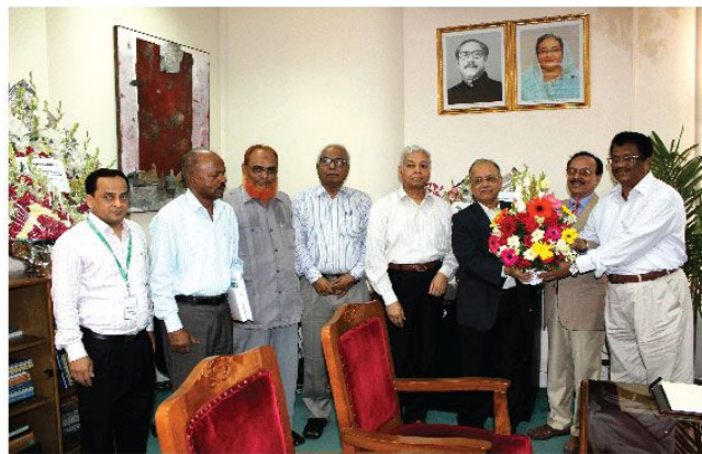
The seven-member delegation of Prime University with the Honorable Chairman of the University Grants Commission of Bangladesh on 13.5.15