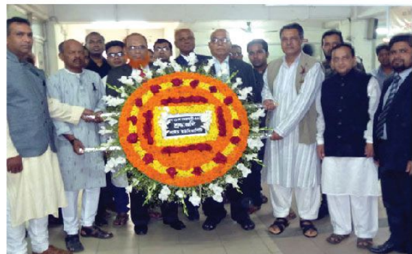
BOT Member, Treasurer, Registrar, Heads of different departments, Faculty Members, Executives and others on their way to pay tribute to the language martyrs on 21.02.2015

21st February, 1952 is forever remembered for the supreme sacrifices made on this day. As the International Mother Language Day, it is now observed all over the world. Prime University family also remembered the martyrs of language movement with utmost respect and reverence. On this day Salam, Barkat, Rafique, Jabbar and many others laid down their lives to protect the prestige of Bengali language. A procession was brought out very early in the morning from the university premises to commemorate the sacrifices of the martyrs. When the procession was over, a garland was placed at the foot of the monument especially built for the occasion. This year Prime University arranged a colorful program to observe the international day. At the very beginning of the program a discussion session was held. The speakers highlighted the significance of this particular day. Then a cultural contest was held among the students. Many students participated in recitation contest, competition of patriotic song and extemporary speech contest. The contests were really enjoyable as all the performances were impressive. Actually the participants created a big