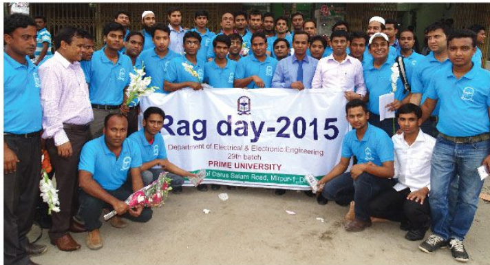
Students of EEE department pose for photograph with the Head and Office Executive of the department on their Rag Day on 03.4.2015