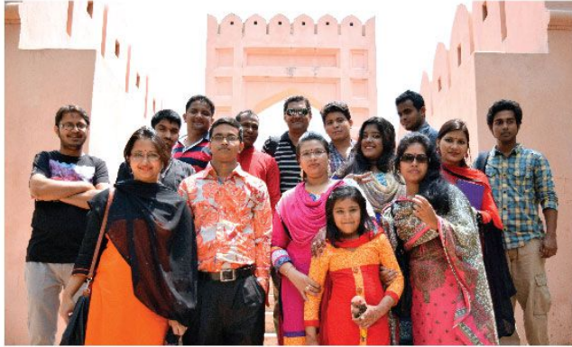
Mentors, members of PUDS and their family members at Idrakpur Fort on 18.04.2015

After going through a hectic schedule with debate competitions and the stress of examinations, members of Prime University Debating Society (PUDS) gave themselves a well-deserved break through the annual picnic that took place at Munshiganj district on 18th April