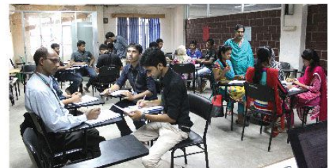
Students in group discussion in a language class in May 2015

Language skill development is a key factor in higher studies and work fields in the country and abroad. Employment opportunities, higher education facilities and business activities are also closely linked with some of the languages. With this fact in view, Prime University has taken a giant step in addressing the crucial issue of teaching foreign languages. The university has been running English Language School since 2007 covering both credit as well as non-credit courses. The credit courses are designed for all the departments other than English