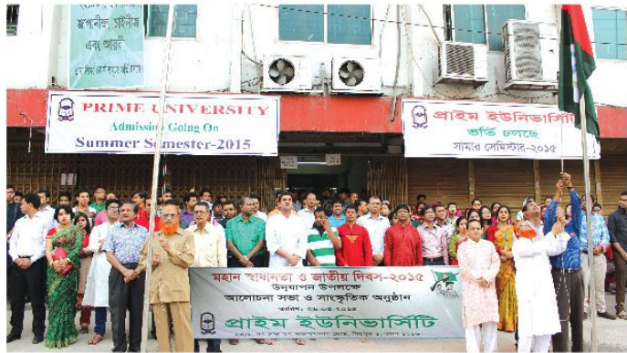
Treasurer and Controller of Examinations hoisting the national flag on 26.3.15